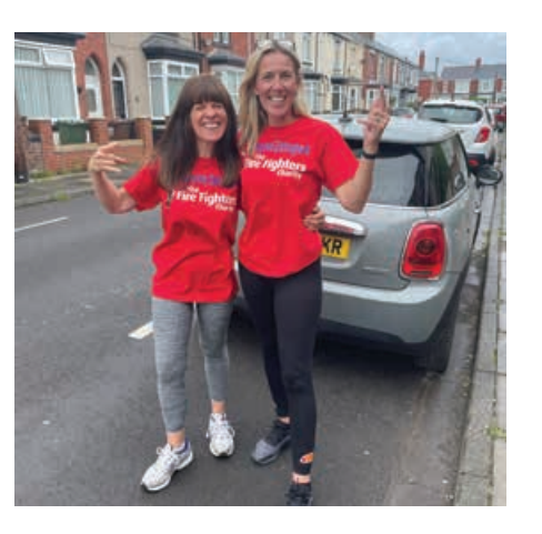
Be inspired on MyFFC Meet other incredible fundraisers, discuss your next challenge, share tips and find out what others are up to via our library of content, or in any of the fundraising or events groups on MyFFC. Register today at www.firefighterscharity.org.uk/myffc